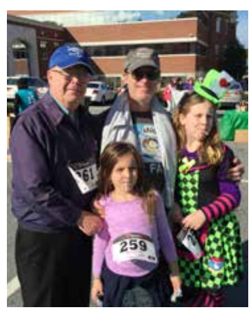
Nash County Government sponsors 3rd Annual Monster Dash 5k Race and 1 mile Fun Run. Over 250 runners participated in the race.