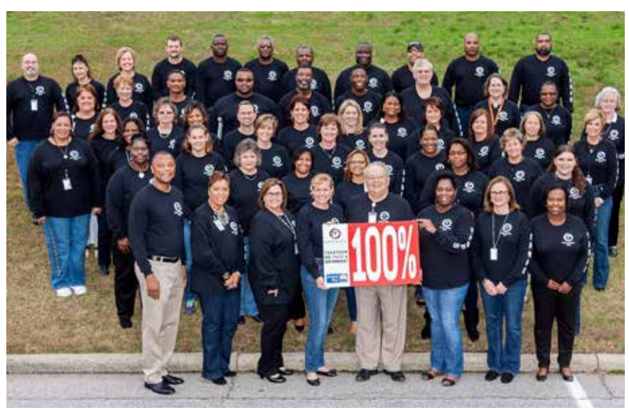
Nash-Rocky Mount Public Schools Central office attains 100% participation for the United Way campaign.