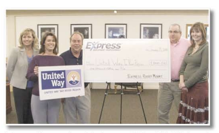
Express Personnel contributes an additional $1,000 through their "Pay It Forward" campaign; with a total Contribution of $9,400